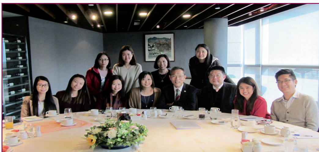
Media luncheon in December 2016 (please refer to page 10 for details)