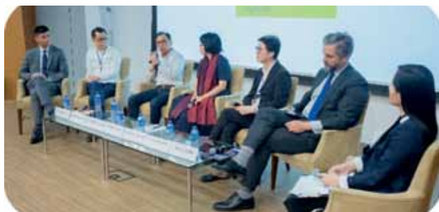
Panel experts sharing ideas in a round-table discussion

The programmes continued with parallel sessions including the following sub-themes: Climate Change and Disaster Risks; Crisis and Emergency Risk Communications; Disaster Risk Financing and Transfer; Major Incident and Mass Casualty Management; Innovations in Disaster Management; and WHO Health Emergency and Disaster Risk Management. The Conference ended with a round-table discussion on Multi-sectoral Efforts to Build Resilience, in which experts from different sectors used Typhoon Mangkhut as an example to examine and discuss how resilience could be enhanced through long-term collaboration.