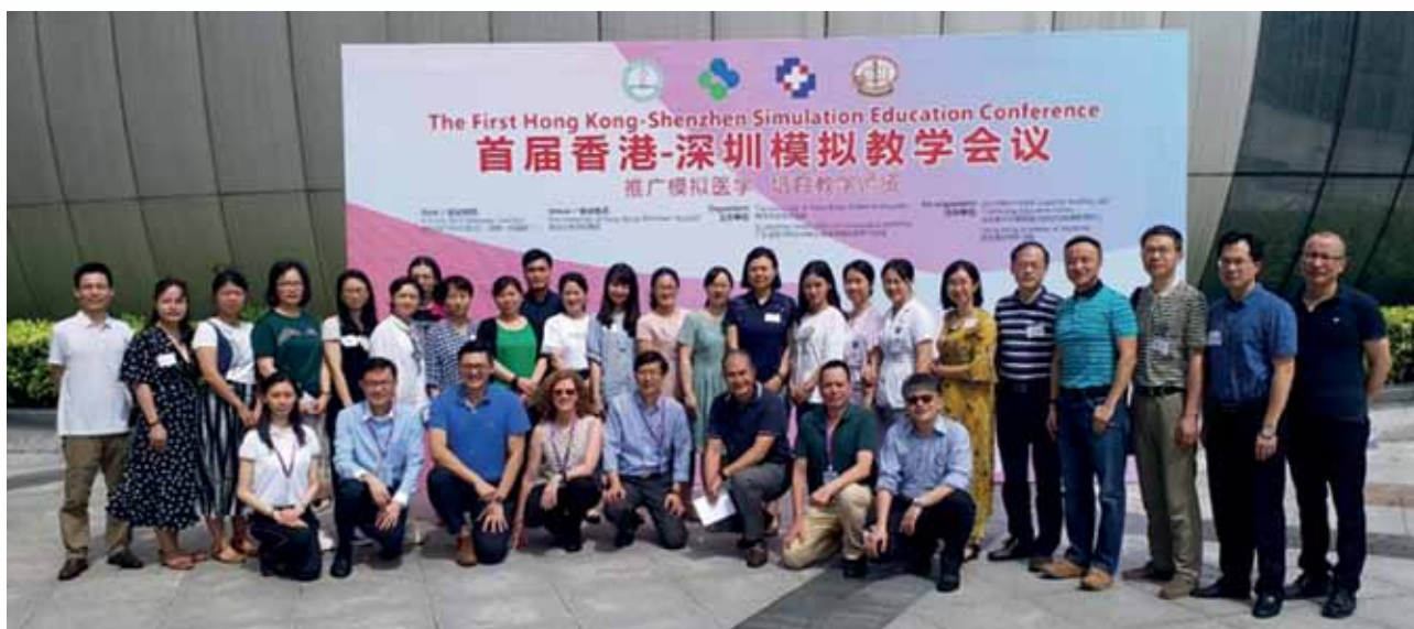
Group photo of Workshop instructors and participants – 9 July 2019