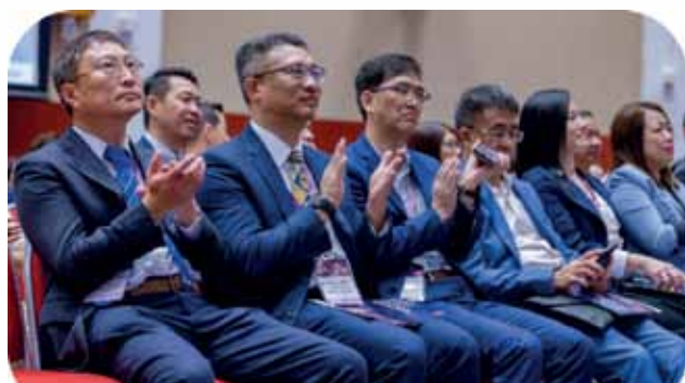
Delegates appreciating the Keynote Speakers

The programme started with two Keynote speeches on ‘Survive and Thrive: Lessons from 100RC’s Global Urban Resilience Movement’ and ‘China’s Emergency Management Institutional Reform: Background, Progress and Challenge’. There was active exchange between speakers and delegates.