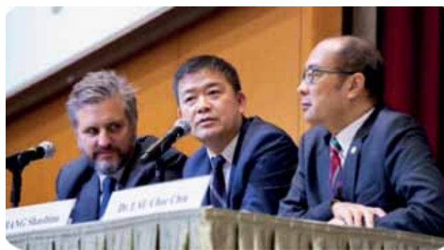
Keynote Speakers addressing questions by delegates