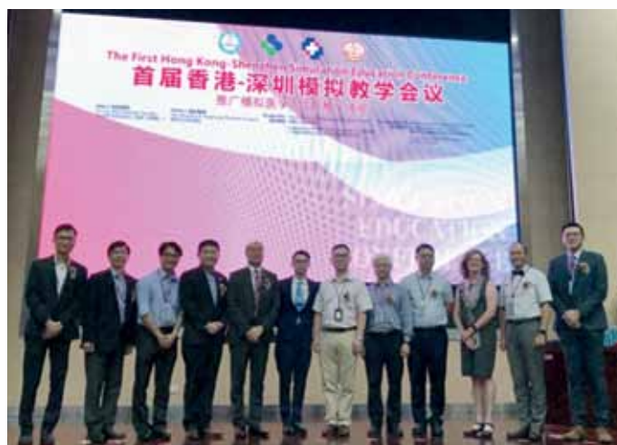
Officiating guests of the Conference – 8 July 2019