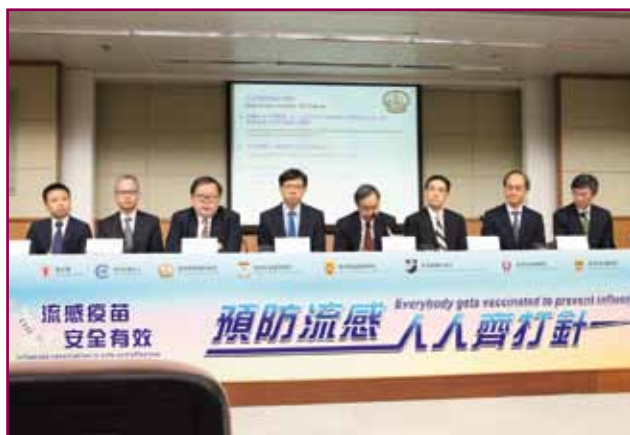
Message delivered by the President to encourage seasonal influenza vaccination