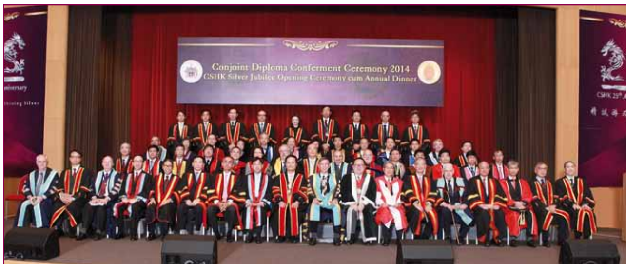
With members of the platform party at the Conferment Ceremony