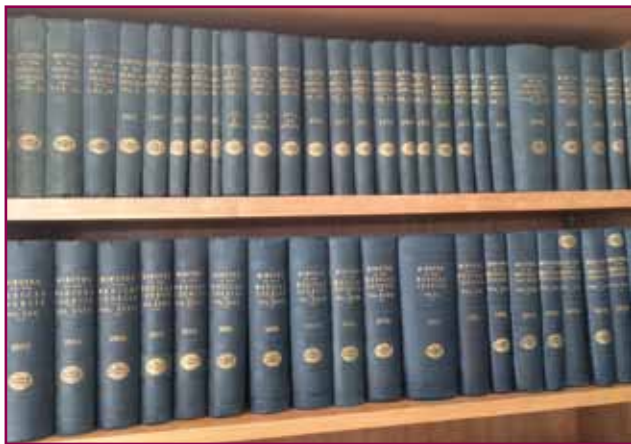
Minutes of GMC meetings date back to 1890s