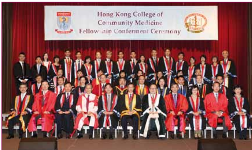
With members of platform party at the Conjoint Diploma Conferment Ceremony