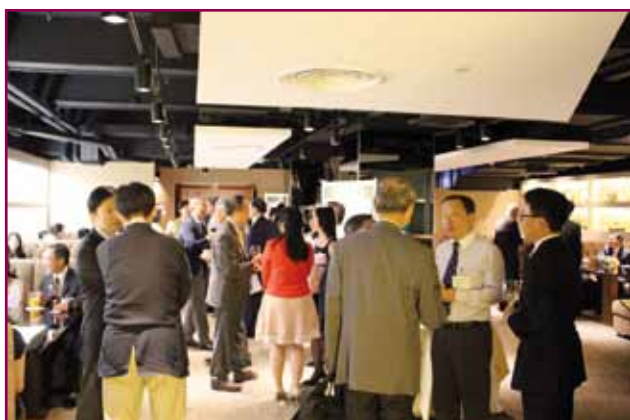
Council Members have a chat with the Distinguished Young Fellows