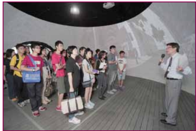
A guided tour at the IGLOO, a 360-degree projection dome