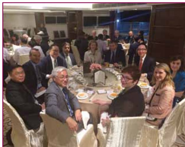
At a Gala Dinner with the guests who attended the Symposium