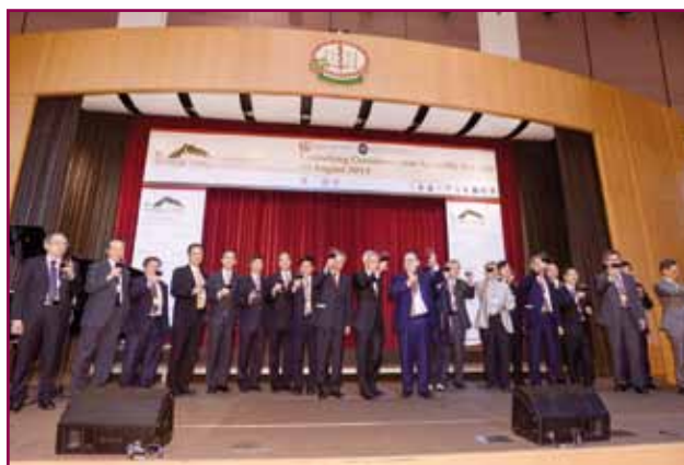
Toasting by Council Members of HKAM at the celebration dinner