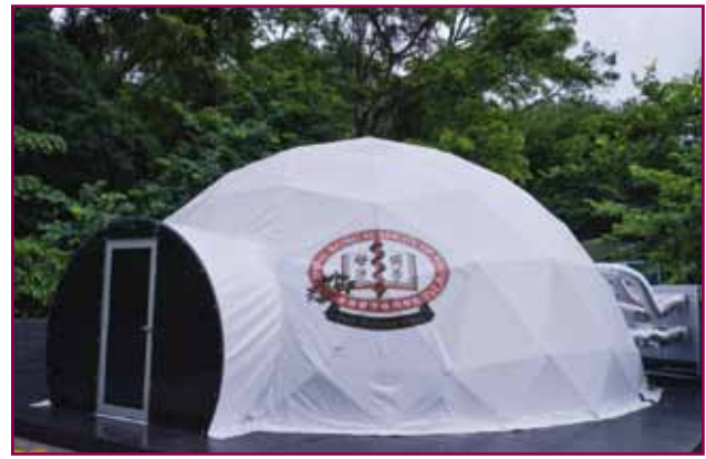
IGLOO, a 360-degree dome-shaped projection for simulation exercises