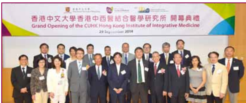
With the Secretary for Food and Health and other invited VIP guests at the Grand Opening