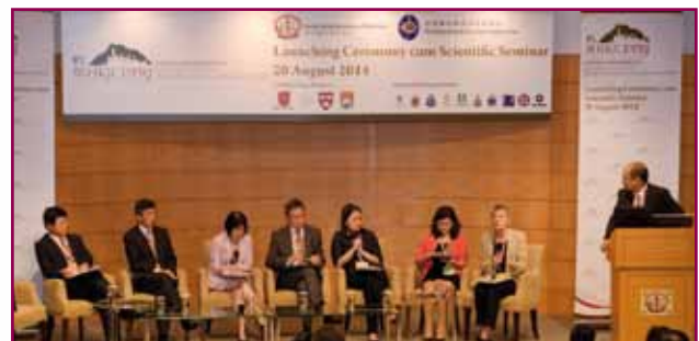
Discussion forum participated by disaster management leaders and collaborators of HKJC DPRI