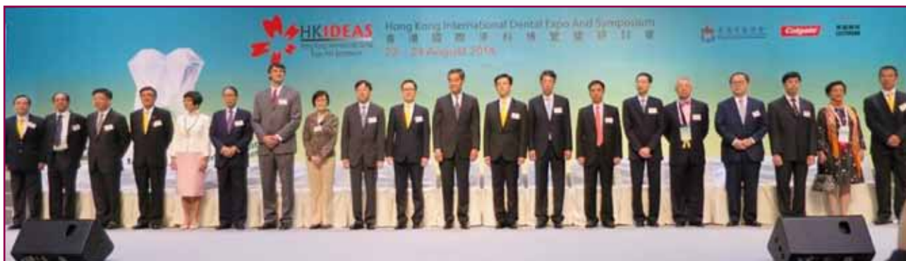
With the CE of the HKSAR and other officiating guests on stage