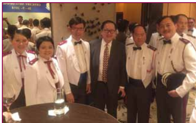
With AMS Officers at the Mess Dinner