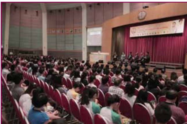
Participants at the distinguished guest sharing session