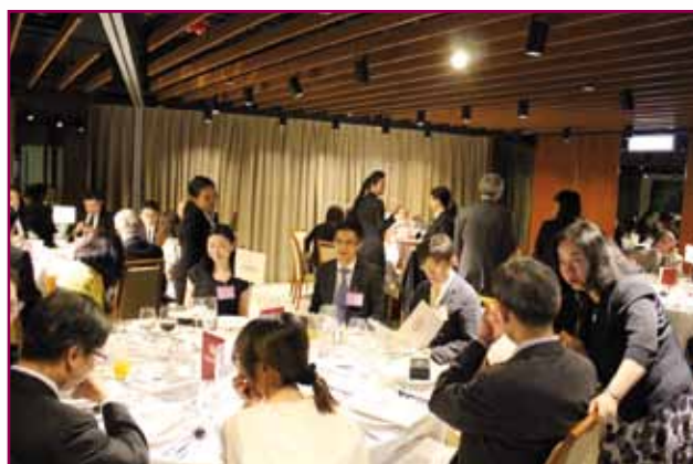
Council Members and Distinguished Young Fellows at the Council Dinner