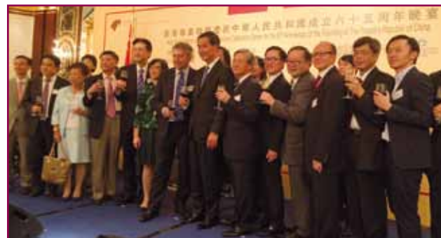
With the CE of the HKSAR and other stage guests