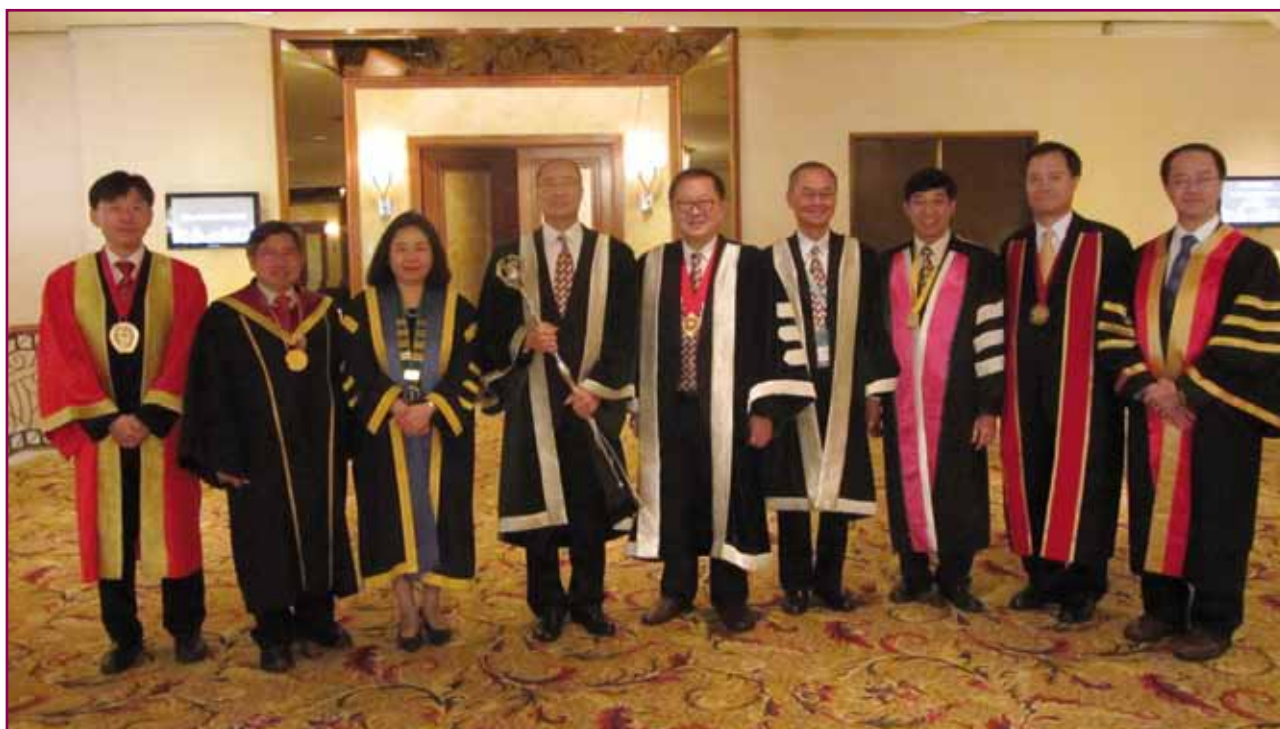
With the delegation of HKAM at the Opening Ceremony