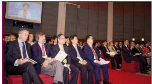
Video congratulatory message delivered by Director-General of WHO, Dr Margaret Chan