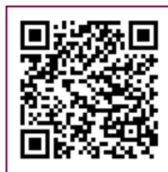
QR code (Android)

We have started selecting some CMECPD activities held by the Academy/Colleges at the HKAM Jockey Club Building in November and December for trial run. Fellows can either use the App to scan the QR code of the event or use their new Fellowship Card (with QR code) to capture attendance via the iPad/tablet device provided by organiser. The full version of the App is expected to be ready by early 2015. Details will be announced in due course.