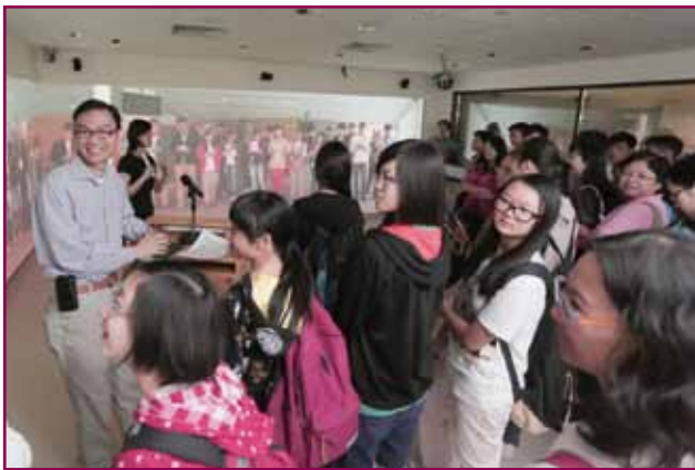
Simulation guided tour at the HKJC ILCM