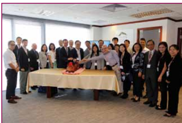
Group photo taken at the roast-pig cutting ceremony, which commences the operation of HKJC DPRI