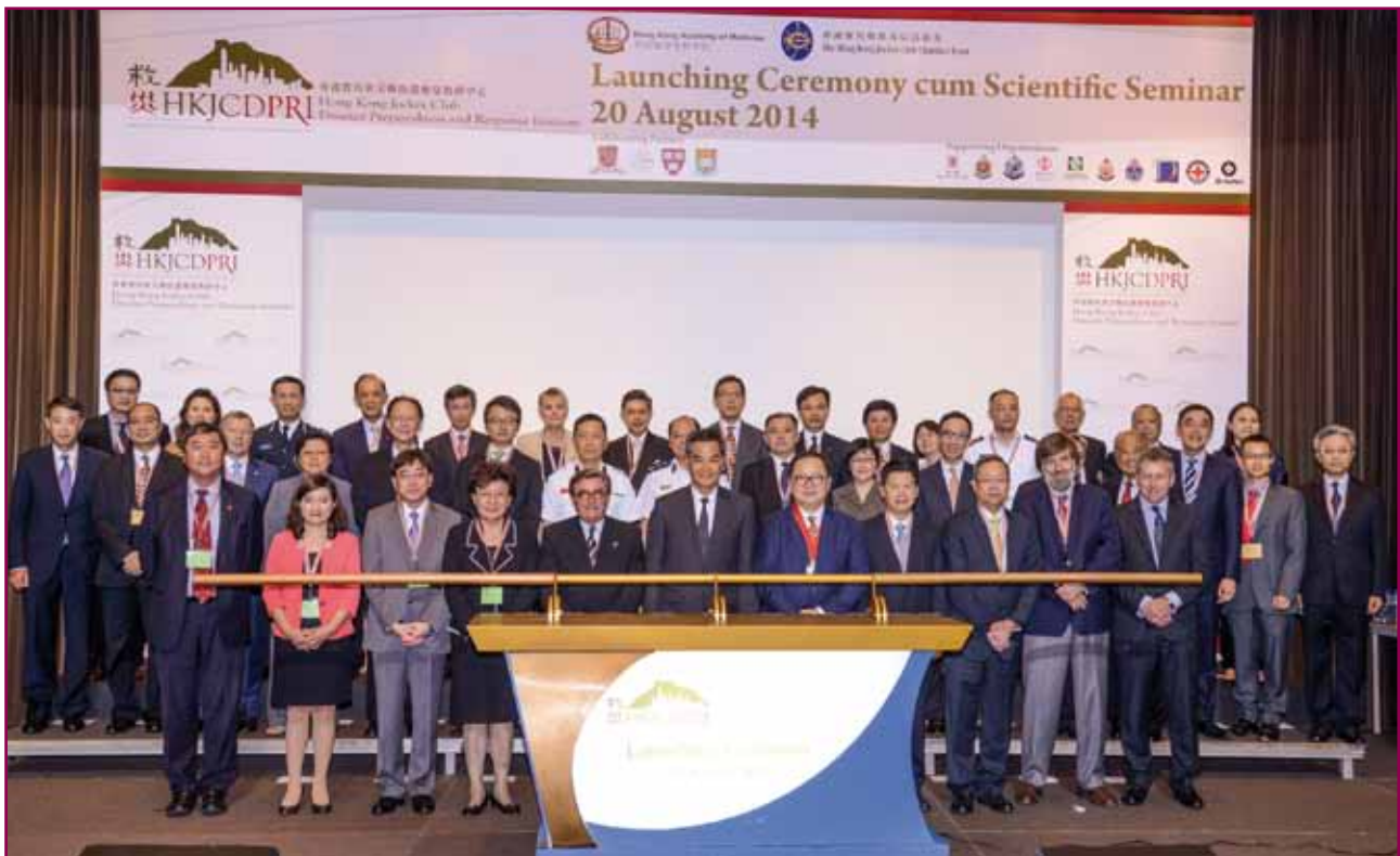
Group photo with all officiating and special guests on stage