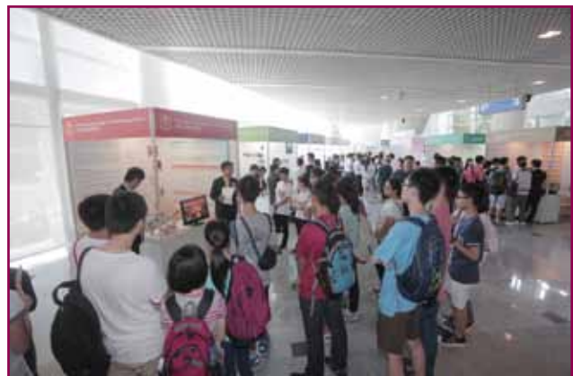
Participants gather information about medical specialties at open day exhibits