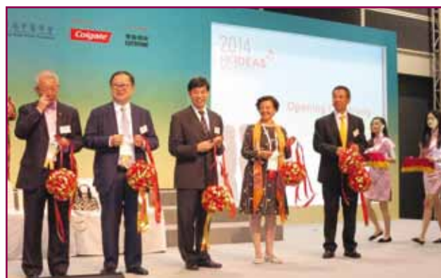
Ribbon cutting at the Opening Ceremony of HKIDEAS