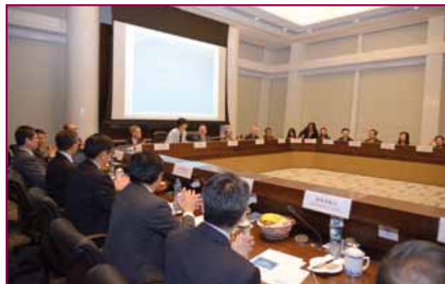
A meeting between representatives from NHFPC and the Council Members of the Academy before the Signing Ceremony

Minister Li Bin also visited the Academy's Hong Kong Jockey Club Innovative Learning Centre for Medicine (HKJC ILCM) after the Signing Ceremony and she was very impressed by the innovative and interactive technologies used in training medical practitioners with patient safety as the main objective.