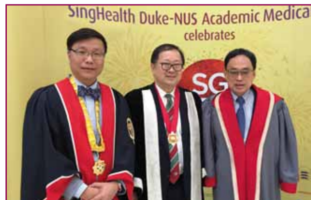
At the Fellowship Conferment Ceremony

President, Officers, and College Presidents or representatives participated in the 49th Singapore-Malaysia Congress of Medicine held at The Academia, Singapore. The theme of the Congress was 'Greater Integration for Better Patient Care'. President delivered a welcome address at the Induction Comitia and was a member of the stage party at the Fellowship Conferment Ceremony, which was also attended by the HKAM delegation. In addition, President presented on the topic of 'Medico-legal Challenge in Hong Kong' at the Medico-legal Symposium.