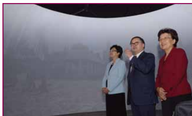
Minister Li Bin visits the Igloo to experience the 360-degree screen, and takes keen interest in the set-up and running of the Igloo