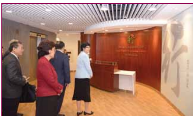
Minister Li Bin visits the HKJC ILCM after the Signing Ceremony