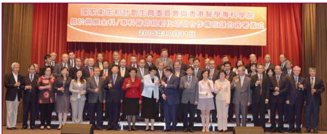
Guests toast the signing of MOU