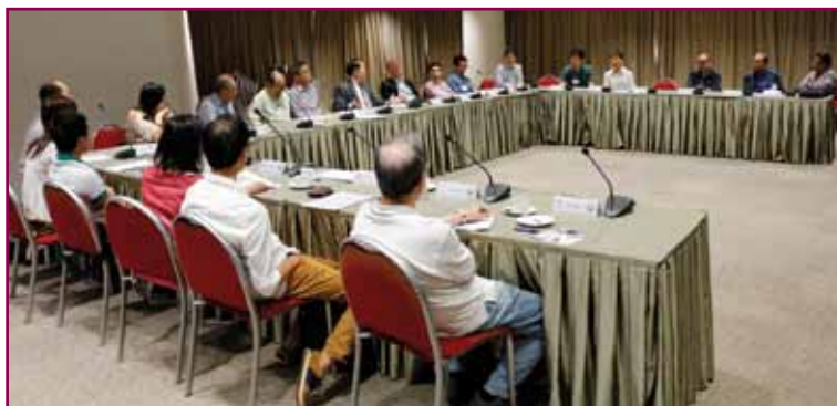
Participants share their ideas with President and other Officers of the Academy