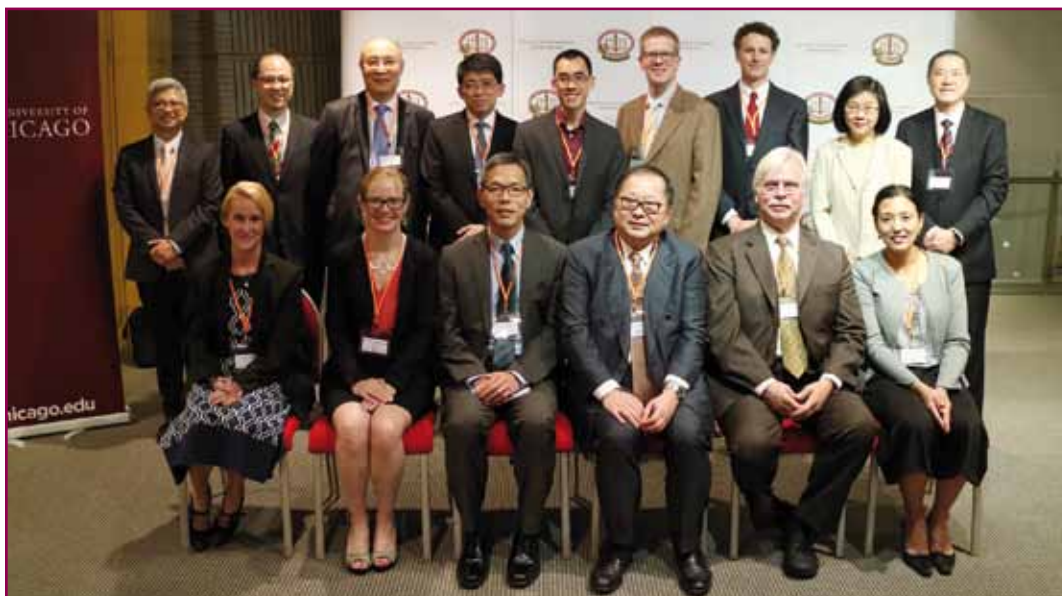
Speakers and guests from the University of Chicago gather for a group photo