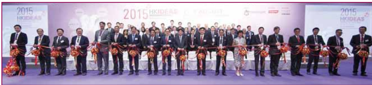
With Guest of Honour, Dr the Hon Ko Wing-man and other officiating guests on stage

President was invited to attend the Hong Kong International Dental Expo and Symposium (HKIDEAS) 2015 organised by the Hong Kong Dental Association as an officiating guest. HKIDEAS 2015 attracted the participation of about 4000 delegates from 31 countries. Secretary for Food and Health, Dr the Hon Ko Wing-man also graced the HKIDEAS with his presence as the Guest of Honour.