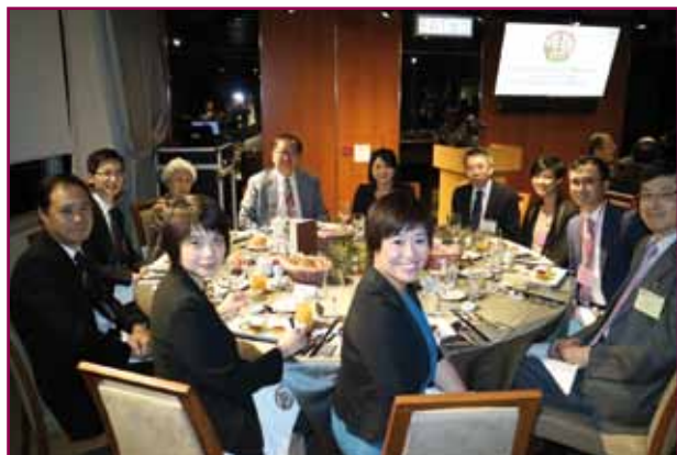
Young Fellows enjoying the dinner with some Council members