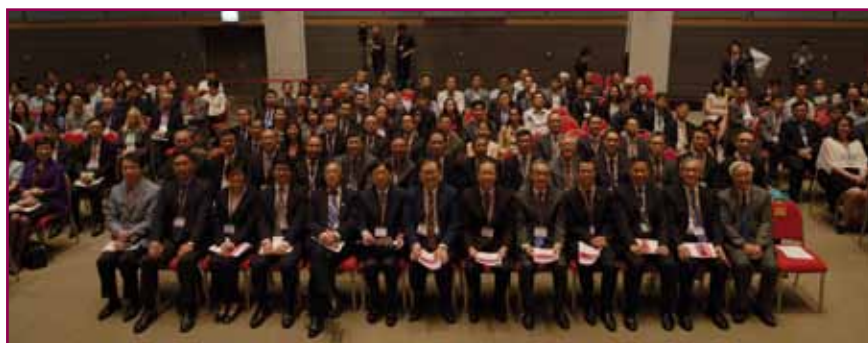
Group photo of all guests and participants at the opening ceremony of the ACDPR