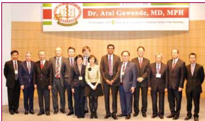
Group photo of all the guests after the lecture