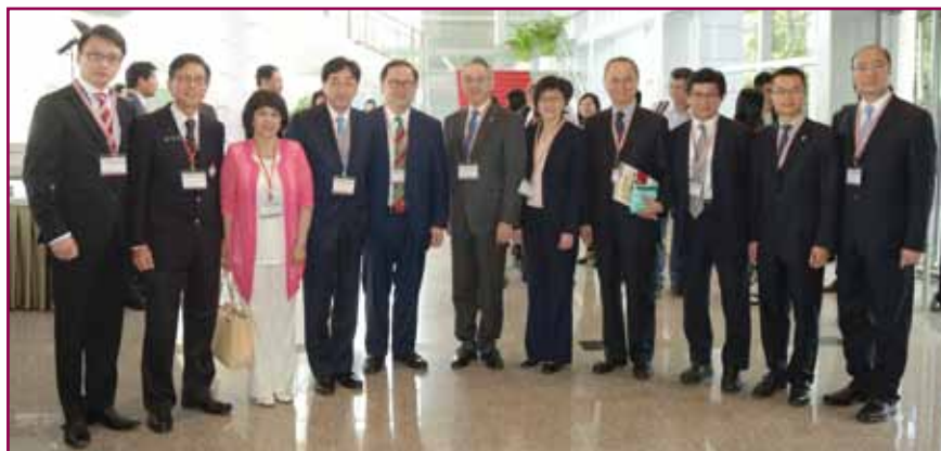
Guests arriving at the opening ceremony