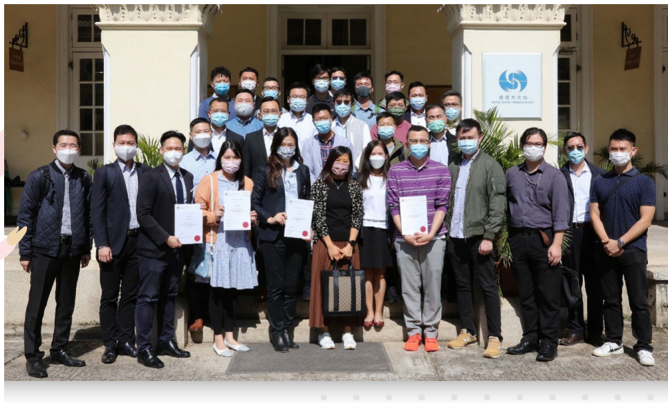
Participants of the first cohort of the HKJCDPRI Advanced Certificate in Emergency and Disaster Management course visit the Hong Kong Observatory

The first cohort of 30 participants from 19 government, non-government, public, and private entities completed the course successfully. The second cohort started in April 2022.