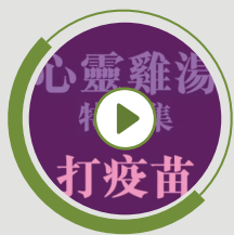
Special edition: 打疫苗