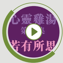
2nd episode: 若有所思