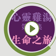
6th episode: 生命之旅