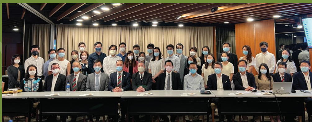
Academy Officers, Council members, and Young Fellows Chapter members at the handover meeting

total of 26 YFC members from 15 Academy Colleges. The Academy Officers and several Council members also attended the meeting, shared some of their visions, and engaged in discussion with YFC members.