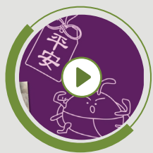
1st episode: 病人的禮物

Past episodes are also available on the Academy website :