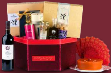
Summer Palace Ruby Hamper