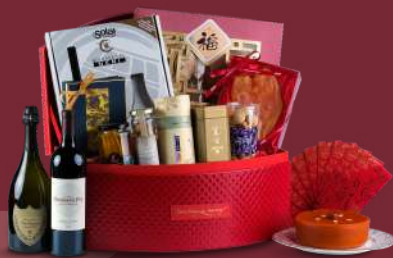
Summer Palace Platinum Hamper