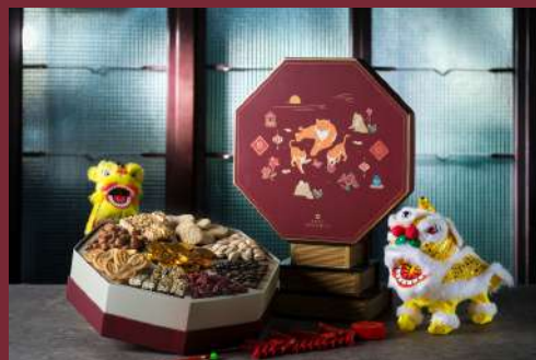
Shangri-La Prosperity Premium Assorted Gift Box (Deluxe Chinese New Year Candy Box) 香格里拉福虎踏春賀年禮盒 (精選賀年全盒) Original Price HKD388 / Discount Price HKD310.4