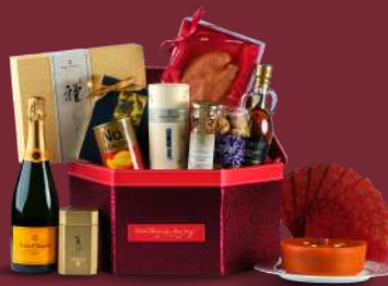
Summer Palace Jade Hamper

Original Price HKD2,788 / Discount Price HKD2,230.4