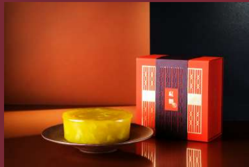
Hung Tong Water Chestnut Pudding 紅糖馬蹄糕 Original Price HKD328 / Discount Price HKD246