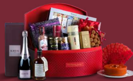
Summer Palace Golden Jubilation Hamper

Original Price HKD6,188 / Discount Price HKD4,950.4