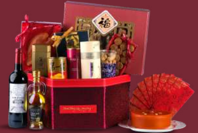
Summer Palace Diamond Hamper

Original Price HKD3,588 / Discount Price HKD2,870.4