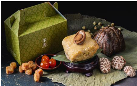
Sticky Rice Dumpling with Abalone, Dried Scallop, Roasted Pork and Salted Egg Yolk 鮑魚裹蒸粽 Original Price: HK$318 Discount Price: HK$222.6