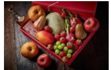
Shang Palace deluxe fruit hamper 香宮豪華水果禮物籃 Original Price: HK$2,388 Discount Price: HK$1,791