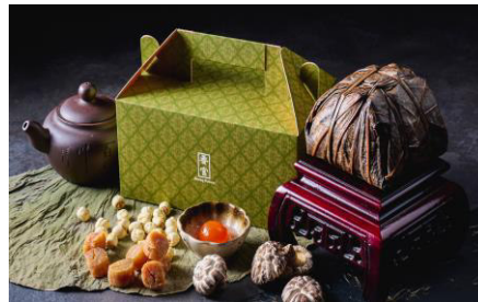
Sticky Rice Dumpling with Dried Scallop, Roaster Pork and Salted Egg Yolk 瑤柱裹蒸粽 Original Price: HK$248 Discount Price: HK$173.6