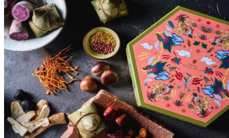
Taste of Asia Gift Box (box of 6) 亞洲風味禮盒 (一盒六隻) Original Price: HK$628 Discount Price: HK$439.6