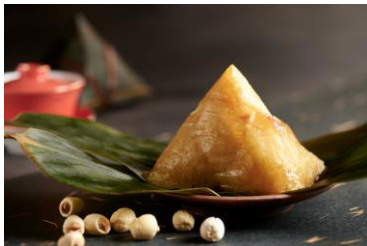
Sweetened lotus seed paste dumpling 蓮蓉棧水糰 Original Price: HK$88 Discount Price: HK$61.6