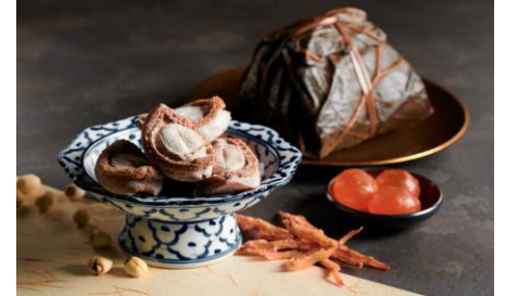
26-head Yoshihama Abalone and Yunnan Ham Dumpling 26 頭吉品乾鮑魚金腿粽 Original Price: HK$1,988 Discount Price: HK$1,689.8