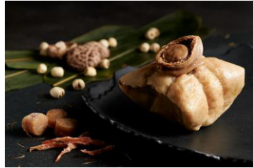
Sticky rice dumpling with abalone, dried scallop, roasted pork and salted egg yolk 鮑魚裹蒸糰 Original Price: HK$318 Discount Price: HK$222.6