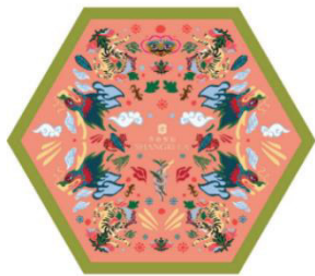
Shang Palace Taste of Asia Gift Box (box of 6) 香宮亞洲風味禮盒 (一盒六隻) Original Price: HK$628 Discount Price: HK$439.6