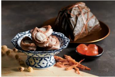
26-head Yoshihama abalone and Yunnan ham dumpling 26 頭吉品乾鮑魚金腿糰 Original Price: HK$1,988 Discount Price: HK$1,689.8