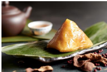
30 years tangerine peel and red bean paste dumpling 三十年陳皮豆沙糰 Original Price: HK$108 Discount Price: HK$75.6