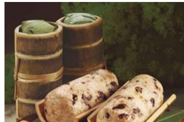
Morrel mushrooms, imperial fungus and assorted mushrooms five grains bamboo dumpling 羊肚菌如意野菌五穀竹筒素糰 Original Price: HK$198 Discount Price: HK$138.6