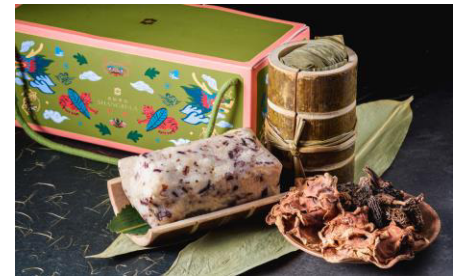
Morrel Mushrooms, Imperial Fungus and assorted Mushrooms with Five Grains Dumpling served in Bamboo 羊肚菌如意野菌五穀竹筒粽 Original Price: HK$198 Discount Price: HK$138.6