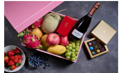
Shang Palace Deluxe Fruit Hamper 香宮豪華水果禮物籃 Original Price: HK$2,388 Discount Price: HK$1,791

All products are subject to availability 所有產品限量發售