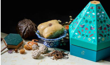
Shangri-La Master Chef Series 香格里拉香傳廚神禮盒 Iberico Pork Belly and Cordyceps Dumpling 冬蟲草西班牙黑豚腩粽 Price: HK$598