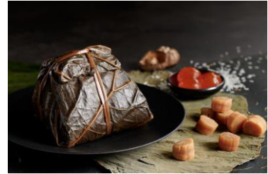
Sticky rice dumpling with dried scallop, pork and salted egg yolk 瑤柱裹蒸糰 Original Price: HK$248 Discount Price: HK$173.6