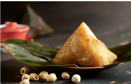
Sweetened Sticky Rice Dumpling with Lotus Seed Paste 蓮蓉棧水粽 Original Price: HK$88 Discount Price: HK$61.6