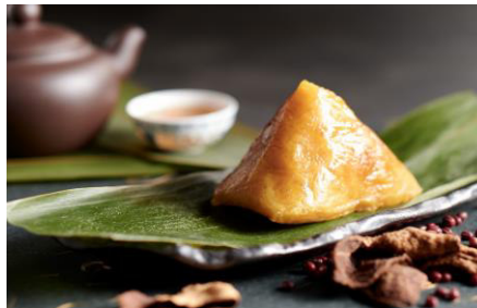
30-year Tangerine Peel and Sweetened Red Bean Paste Dumpling 三十年陳皮豆沙粽 Original Price: HK$108 Discount Price: HK$75.6