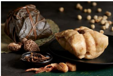
Master Chef Gift Box 香傳廚神禮盒 Iberico pork belly and cordyceps dumpling 蟲草西班牙黑豚腩糰 Price: HK$598